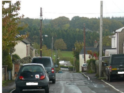
SA1. Milkwall, across the golf course toward the east, Palmers Flat & forest, the other side of the valley

In the north-eastern area of Milkwall there is a small paddock and a football ground.