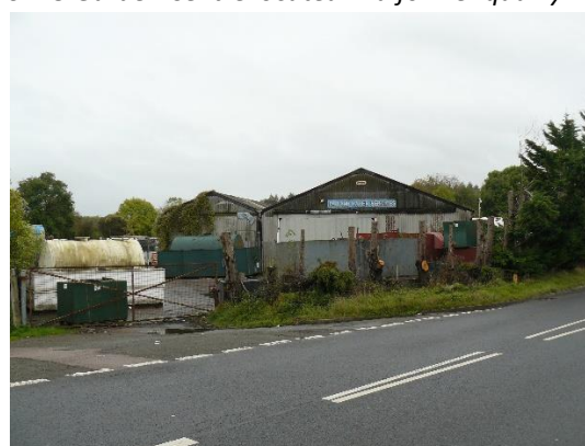
SA16 & 17 Station Rd industrial/commercial cluster at junction