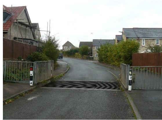
SA19 Cattle grid to prevent the Forest sheep entering Primrose Drive estate