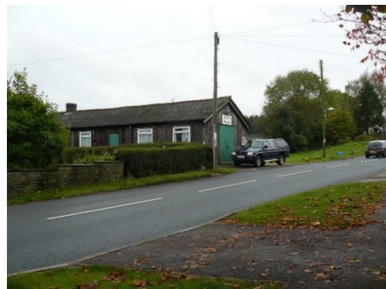
SA23 Milkwall Hall: a WW1 hut