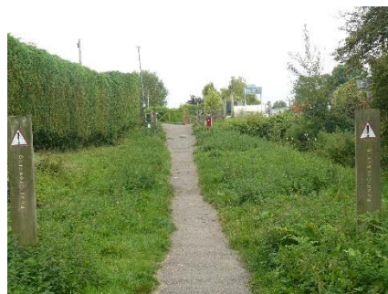
SA3 Cycle track approaching Station Rd Milkwall