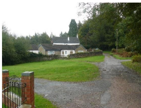
SA14 toward Scarr

There is a mobile home park at the eastern end of Station Road, next to the cycle path.