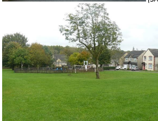
SA12 Play area off Primrose Drive; open plan frontages