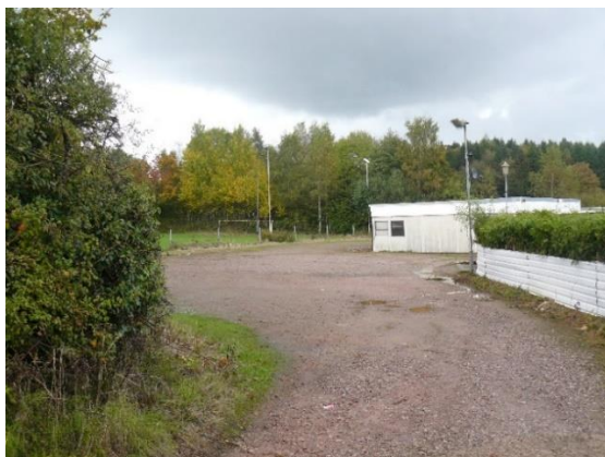
SA22 Football ground Milkwall AFC