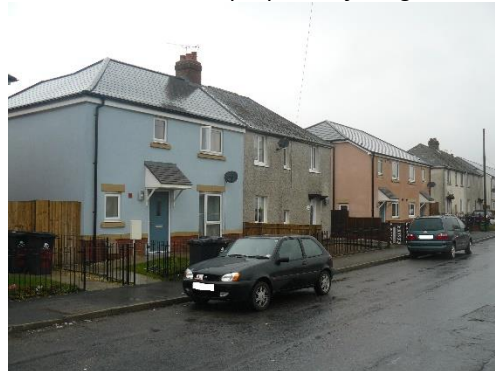
SA6 Refurbished council house style properties with limited on plot parking