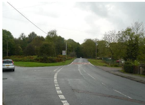
SA2 view across to Lambsquay