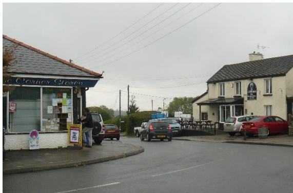
SA8.Shop and Inn at key junction