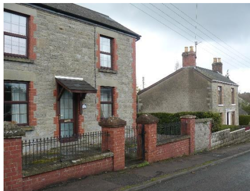
SA10.Use of local stone and brick in 19C construction, with chimneys as local coal was used for fires; larger back than front gardens to provide for vegetable plots.

There are a number of closes off Primrose Drive. There is also a pedestrian access from Forest Road through a grassed area with trees. Within this estate there are several other green areas including a designated children's play area with equipment. Some mature trees have been retained.