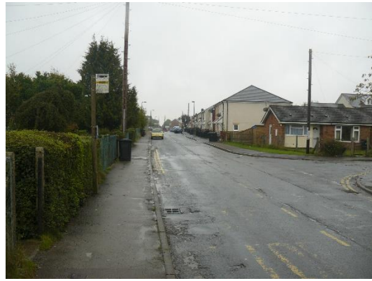
SA4 Note the straight linear look of housing and the poor condition of Tufthorn Ave near the junction with Stepbridge Road, the industrial area. The bungalows, right, are for older people

SA7.Looking uphill along Station Road with Milkwall Hall on the left in middle distance