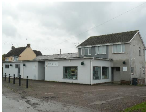
SA9.Former social club now a soft furnishing company, moved out from Coleford town centre

The largest area of housing in Milkwall is in the zone bounded by Tufthorn Road in the west, Edenwall Road to the north, Station Road to the south and the cycle path/former railway line to the east with Forest Road cutting through the area. There are two pedestrian access points to the cycle path along this stretch.