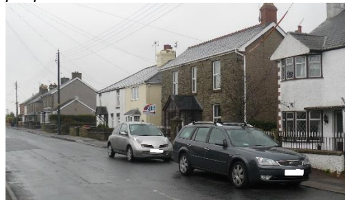
SA5 Older individual properties facing onto the street