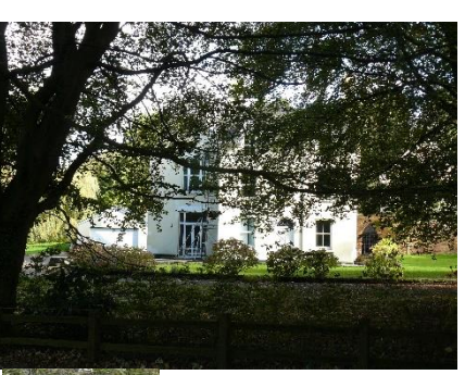
72 Individual 19C dwelling

The only other buildings on the eastern side of the road before the Tufthorn traffic lights are reached are those associated with Perrygrove Farm. These are largely screened by a hedge, but the traditional style 19C farmhouse is partly visible. Beyond the farm is the entrance to the Perrygrove Railway visitor attraction. Apart from these, to the east of the road are hedgerows bounding small fields that rise away from the road to a line of trees at the crest of the ridge.