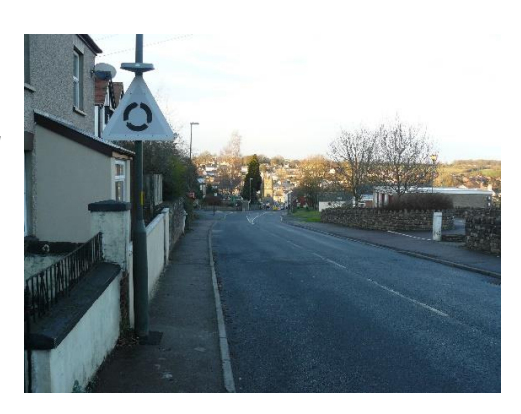
86 From Cinderhill north to Coleford town centre. Fire Station on the right.