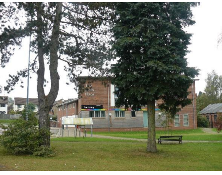
79The cycle path crosses by the Main Place