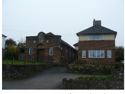
82 St Margaret Mary's RC Church

The Forest of Dean District Council offices are off this roundabout too.