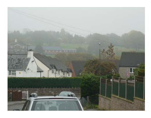
85From top of Old Station Way/ High Nash, glimpsed views of Bells Golf Course beyond industrial estate.