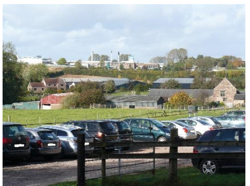
74 Suntory Ribena factory viewed over Puzzle Wood car park

It then passes a development of warden assisted bungalows and a short row of terraced town houses before it reaches its junction with Lords Hill.