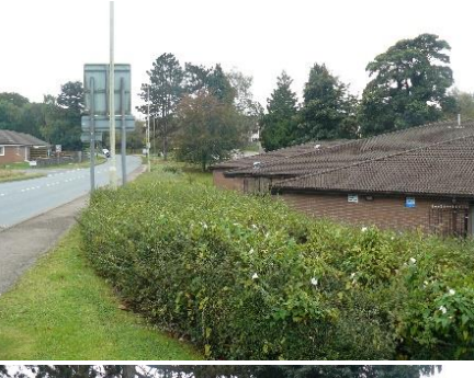
78 Pyart Court below Old Station Way, and with parking. The cycle path crosses in the background